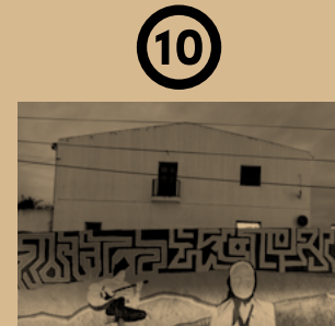
10 UNTITLED Orphão

10B Centro da Ciência e do Café (Centre for Science & Coffee)