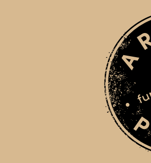
10A Adega Mayor

Lat: 39.018427 Long: -7.065990 Muro, Campo Maior