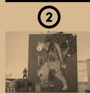
2 UNTITLED NADA

Lat: 39.013072 Long: -7.06019 Ass. Caçadores Polivalente building, Nossa Sra. da Expectação Town Council, Campo Maior