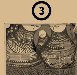
3 UNTITLED NADA

Lat: 39.015688 Long: -7.068676 Rua Dr. Telo da Gama, Campo Maior