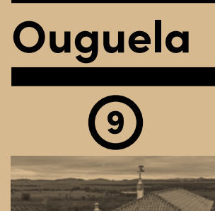
9 UNTITLED Orphão

Lat: 39.017900 Long: -7.075432 EDP Distribuição transforma- ção substation, Fonte Nova, Campo Maior